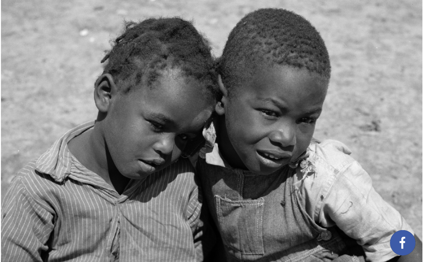
Sharecropper boys in 1936